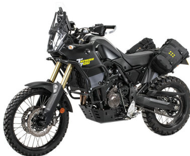
OS-BASE YAMAHA TENERE 700 KOSBA-D