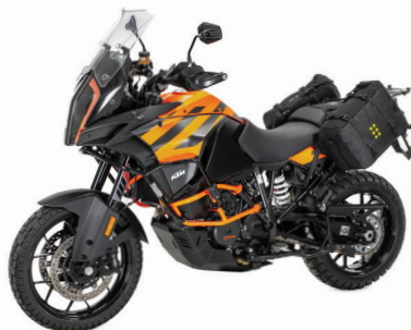
OS-BASE KTM 1050-1290 ADVENTURE KOSBA-A