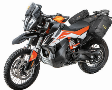
OS-BASE KTM 790 / 890 ADVENTURE KOSBA-B