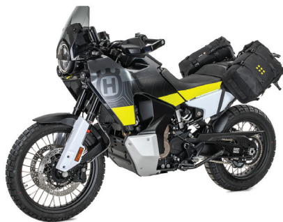
OS-BASE HUSQVARNA NORDEN 901 KOSBA-H