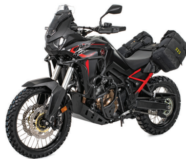
OS-BASE HONDA CRF 1100L excluding Adventure Sports model KOSBA-E